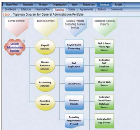
Planview Service Portfolio Management uses a visual topology to display relationships between resources, assets, and business services.

While business leaders prefer to think in terms of new initiatives, the majority of technology spending goes to maintaining the day-to-day operations necessary to run a business. Planview® Service Portfolio Management allows you to effectively gain control of this spending by defining, managing, and reporting on the total cost of delivering services from IT to the business units. This enables your organization to improve overall performance, standardize service delivery, enhance service quality, and reduce the extensive maintenance work performed by IT.